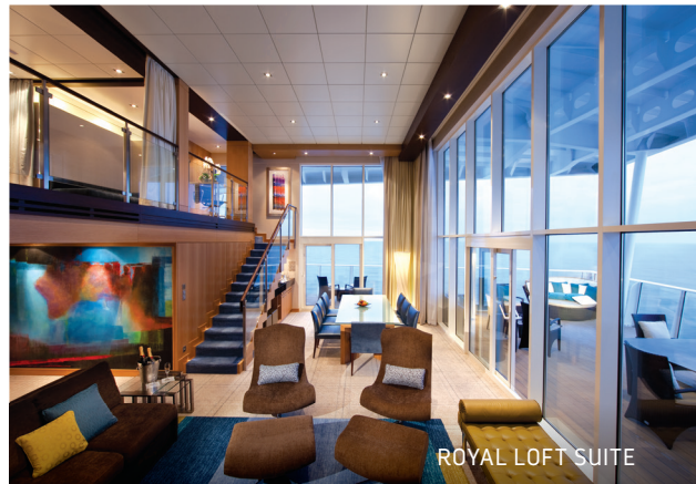
ROYAL LOFT SUITE

Total Staterooms: 2,748 Suites 174 • Balcony 1,796 • Ocean View 176 • Interior 602