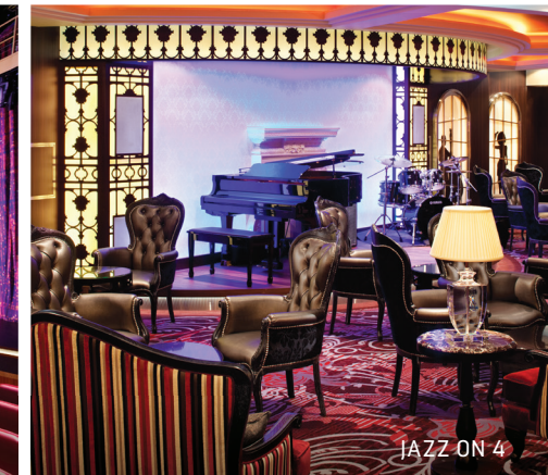
JAZZ ON 4