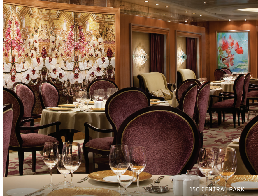
150 CENTRAL PARK