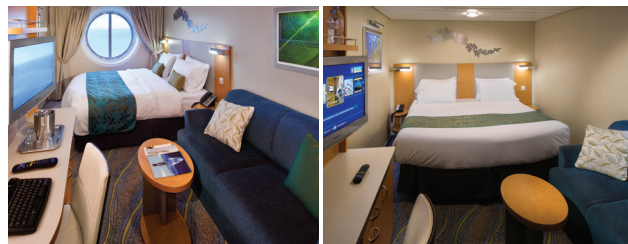
Ocean View Staterooms 176